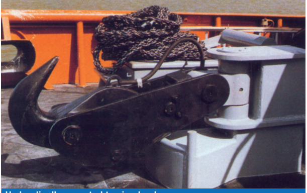
Hydraulically operated towing hook

In addition: We offer reconditioning and repair for a wide range of quick release towing hooks as well as spare parts for all types of Seebeck<sup>®</sup> Towing Hooks.